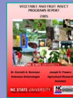
Also CD format